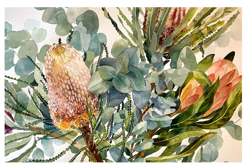
Details of a recently commissioned watercolour artwork.

I believe that considering this will ensure that I put the best energy into your commission. For example, I do love animals but I would rather point you in the direction of someone who specialises in pet portraits if you are looking for a pet portrait. Finding an artist that is creating the kind of work you already like, I believe, is the best key to success when commissioning an artwork.